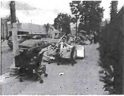
Vermont Marathon 1.JPG 3110K